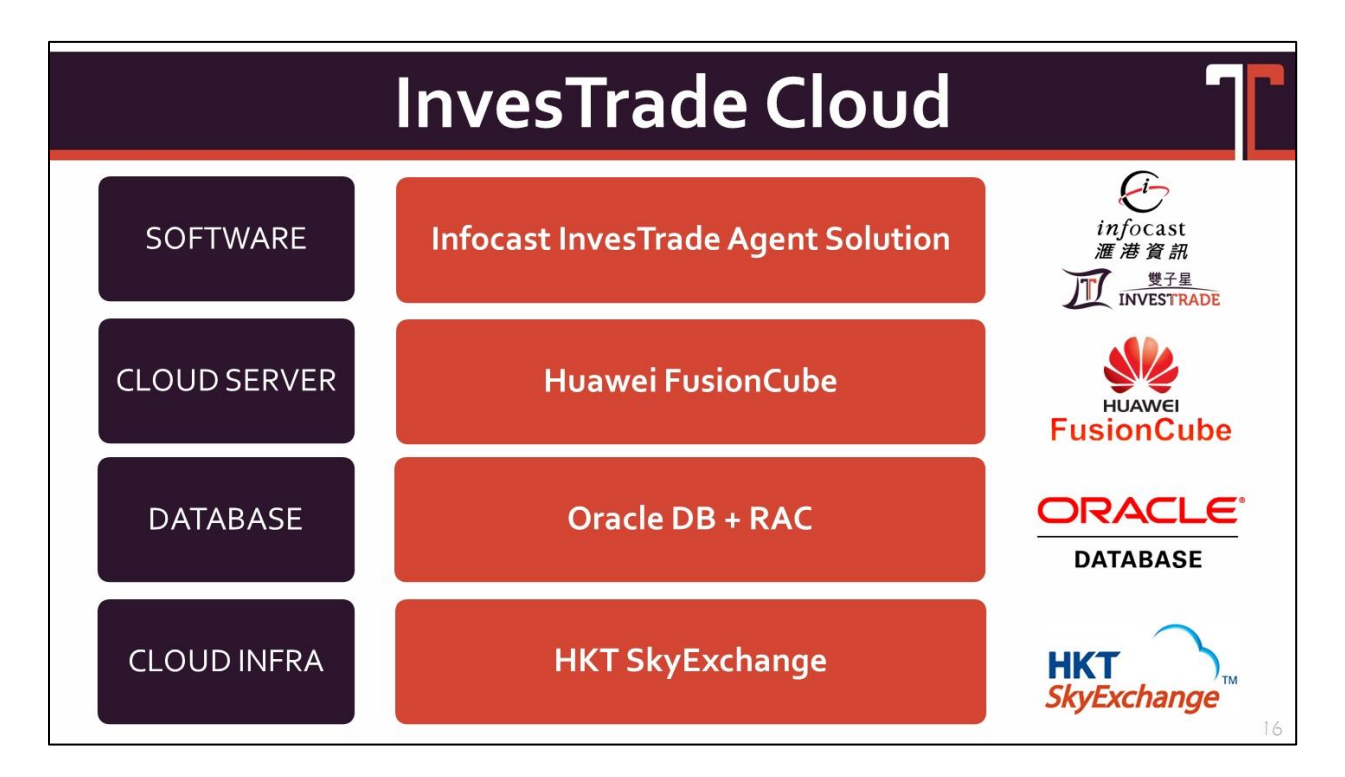
Diagram 3 - InvesTrade Cloud